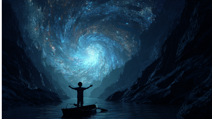
Figure 1: Discovering the cosmic web

The cosmic sense of humor is exquisite. The revolution that unifies Einstein’s elegant vision with quantum reality, that bridges ancient wisdom with cutting-edge science, that finally explains how love operates as measurable physics—this breakthrough came through the most unlikely pair: